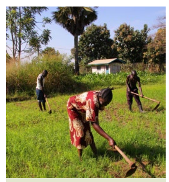
Field trials of high-yield rice varieties at Yei Research Station in South Sudan

stunted and sparse. Other local varieties grow too tall, causing their stalks to break off before the panicles have matured. South Sudanese farmers have probably been relying on these very same seed varieties since 1970, Maurice conjectures. Adjacent to the rice grows a selection of cassava varieties, which he plans to test for resistance to mosaic disease. Across the pathway, Luka's maize plants tower high above the researchers' heads. Luka's MSc research under Richard Edema on the evaluation of maize germplasm for multiple resistance to turcicum leaf blight and maize streak virus has come into its own.