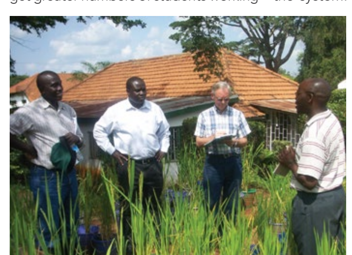
The plant-breeding programme at Uganda's Makerere University involves students in working both with farmers and in the fields and laboratories at NaCRRI

The rationale was partly to harness concentrations of specific expertise in universities to benefit the entire network, and partly to bring students from underperforming faculties and research institution to facilities of relative strength, such as Uganda's NaCCRI, and equip them with the knowledge to transform their systems back home. It was also to get greater numbers of students working