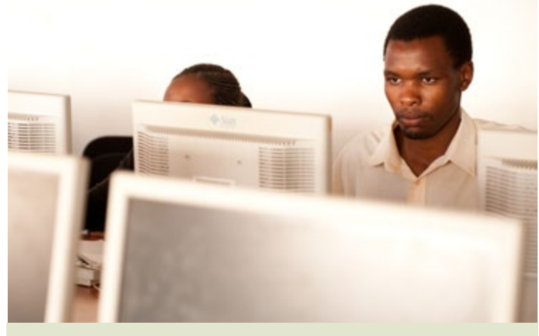
RUFORUM uses ICT for training and research and as a medium for sharing knowledge and experiences across its extensive network. Before its 'IT spring', students could not access literature online or participate in e-forums.

the internet or knew very much about it. In fact, many students did not even know how to use a manual typewriter. This did not bode well for the communications aspects that we now take for granted: accessing literature online, e-discussion forums and even email. Forum, RUFORUM's predecessor, had provided its partner faculties with TEEAL, a CD library of scientific iournals that does not require online access.