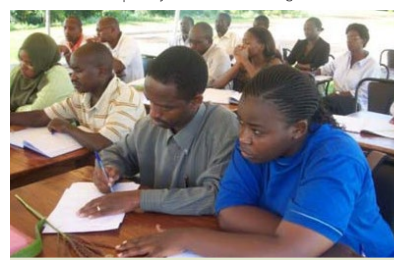
RUFORUM reshapes the way agriculture is taught, emphasising the problems that beset farmers – climate change, environmental degradation and the diseases and pests that lay waste to crops.

Just as important, RUFORUM graduates are equipped to solve the problems of a changing world. They will be at the forefront of Africa's Green Revolution, revamping agricultural research institutions