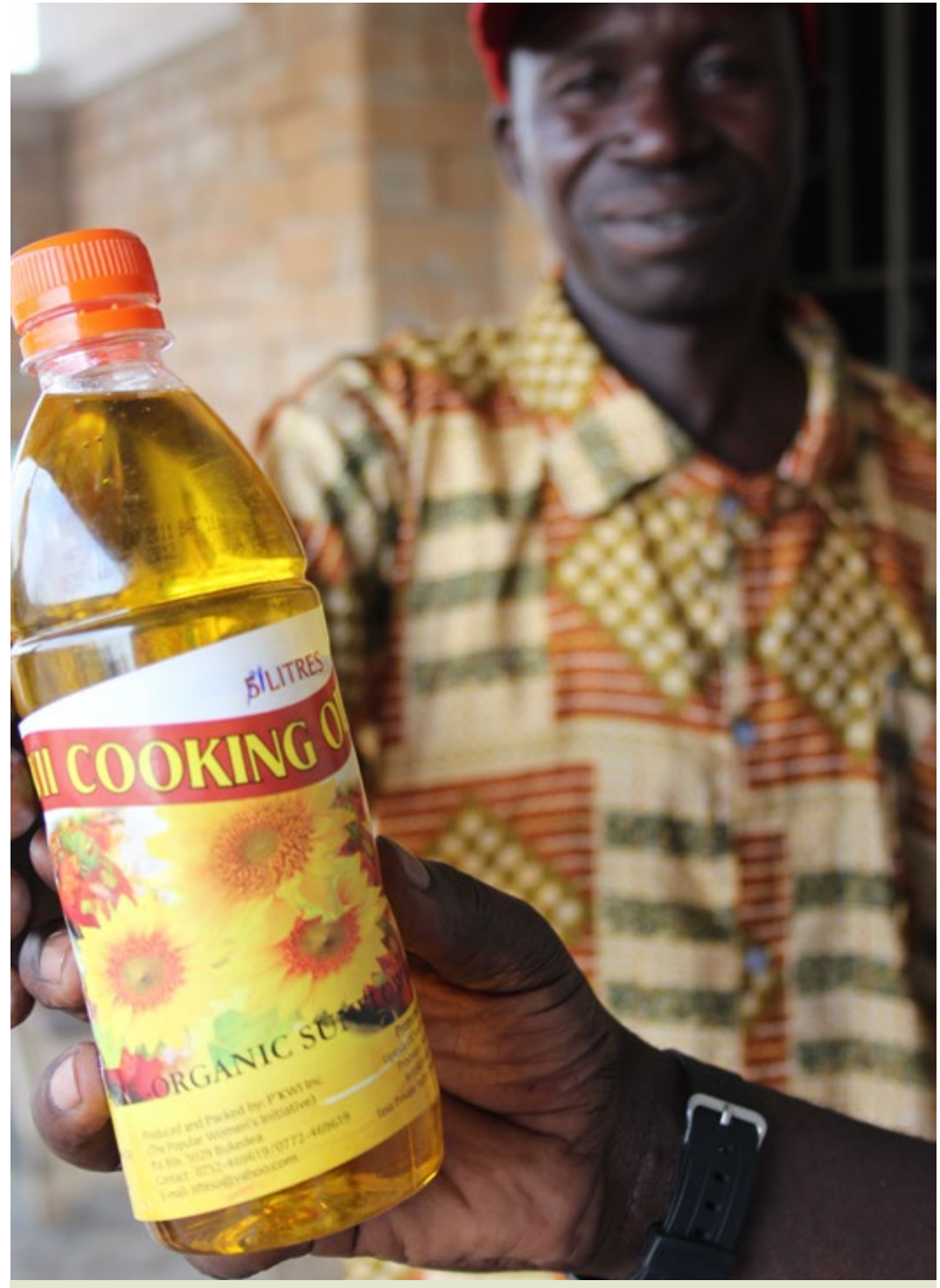
The P'kwii cooperative presses and bottles sunflower oil, an income-generating spinoff from participatory research.

CHAPTER 3 | THE EARLY DAYS CHAPTER 3 | THE EARLY DAYS