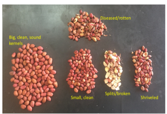
Grading and sorting