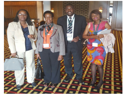
AU Commissioner for Rural Economy & Agriculture H.E. Rhoda Tumusiime with Dr Alex Ariho, AAIN CEO and Rwand minister of agriculture Hon. Gerardine Mukeshimana at EU-AU summit 2016.

“It is a bitter irony that Africa spends annually $35 billion as a net importer of food, when African countries collectively have 25% of World’s the most arable land which generates only 10% of the world’s agricultural output.”