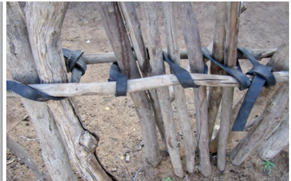
Plate 20: Rubber binds cordia branches