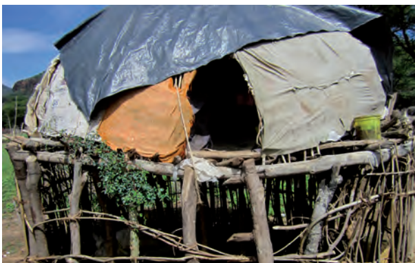
Plate 27: Stilt storage