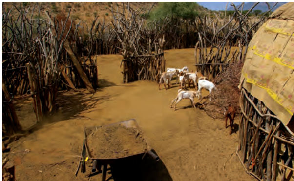
Plate 23: Cleaning of the boma