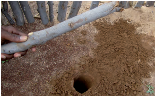
Plate 19: Individual hole, two hand lengths deep