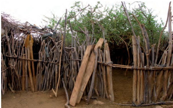
Plate 21: Boma entrance