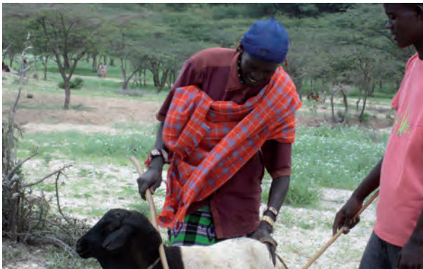
Plate 5: Buyer inspecting a sheep