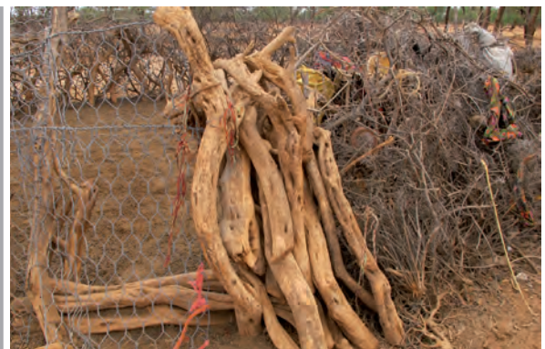
Plate 14: Chain-link fence material