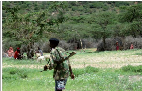
Plate 6: Market security