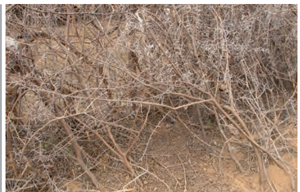
Plate 16: Surrounding acacia branches