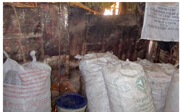
Plate 28: Hay storage in bags