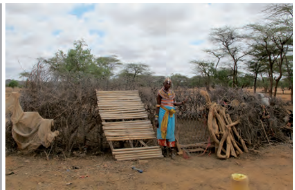
Plate 12: Chain-link boma fence