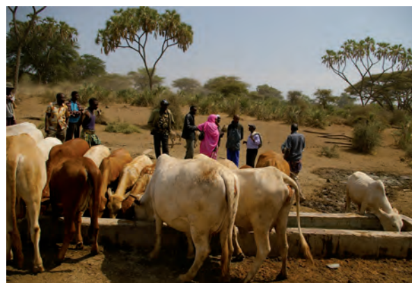
Plate 2: Cattle at the watering trough