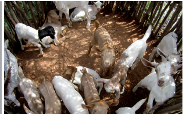
Plate 24: Young animals are kept separately