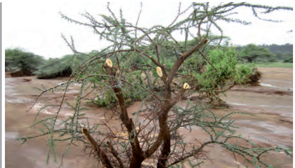
Plate 10: Damages to acacia tree from branch collections