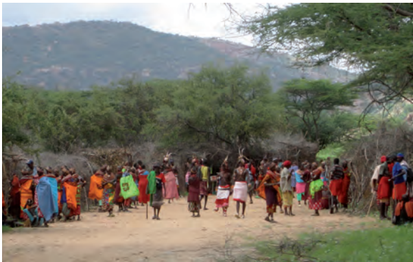
Plate 3: Ilaut market from afar