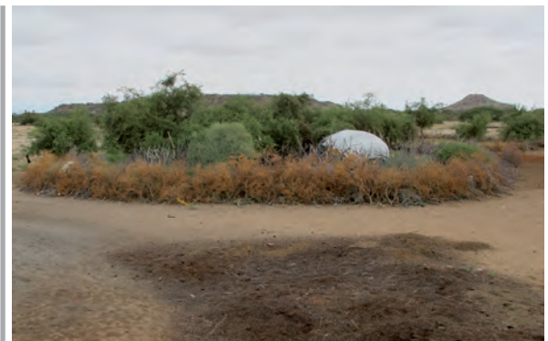
Plate 22: Surrounding acacia branches