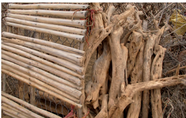
Plate 15: Secure boma door