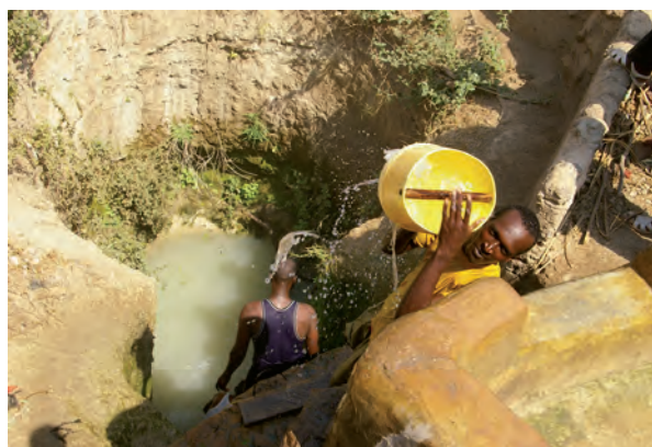
Plate 1: DHEDA well

Future plans of the CBO are to increase the political and legal weight of these traditional Boran regulations by having them made an integral part of their local laws under the new provisions that are catered for in the new Kenyan Constitution. This would solidify and properly enforce the resource management strategies of DHEDA.