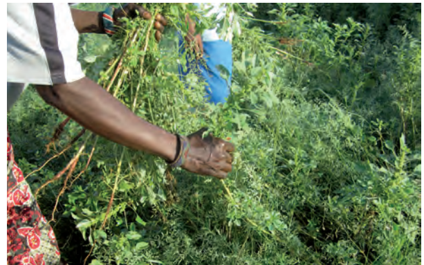
Plate 26: Weeding grass garden