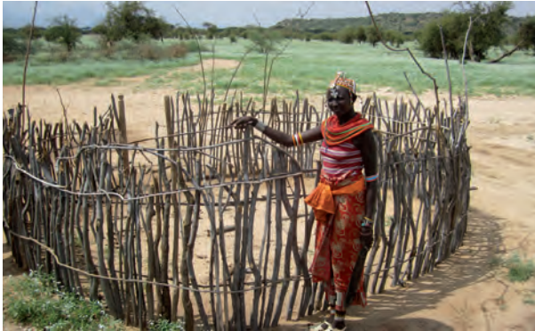
Plate 17: Cordia post boma