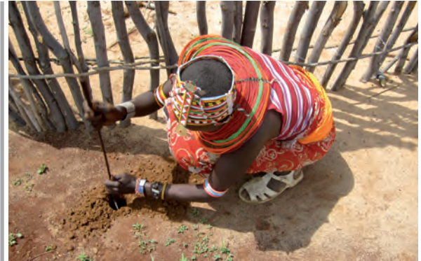
Plate 18: Digging hole with spearhead