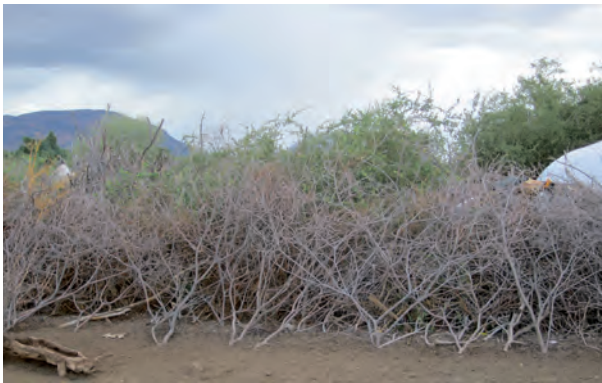
Plate 9: Traditional acacia branch boma

In areas where there is a high incidence of leopards, the livestock keepers will still have to guard their animals at night. This type of fence does not protect the animals from such predators, as they can jump over it and still attack the livestock.