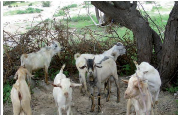
Plate 4: Goats in a "boma" at the market