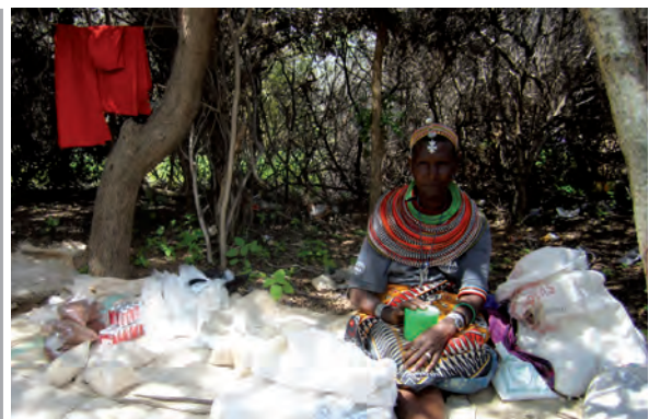
Plate 8: Household goods trader