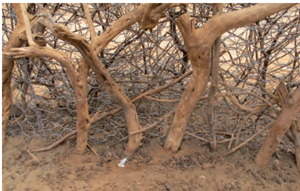
Plate 13: Salvadora posts