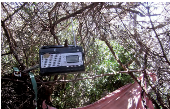
Plate 7: Radio in soup kitchen stall